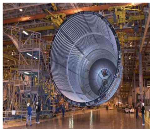
Fig. 1. Mass reduction achieved using Al-Li 2195 in NASA's external tank ( \approx 30\% reduction \approx 3402 kg) [9].

Metallic materials, such as aluminum alloys (e.g., Al-2219 and Al-5083) and stainless steels (e.g., 304 or 316L), are among the oldest materials used in HPV and remain dominant in applications that require high pressure resistance and strong mechanical strength [1,5]. Aluminum-lithium (Al-Li) alloys, with their high strength-to-weight ratio (up to 20% lighter than pure aluminum) (Table 1), are ideal for reducing the weight of cryogenic and hydrogen tanks. These alloys lower the total spacecraft mass and enable greater payload capacity. For instance, in NASA's SLS rocket, these alloys have reduced tank weight by up to 30% while maintaining pressure endurance up to 200 bar without failure (Fig.1) [9].