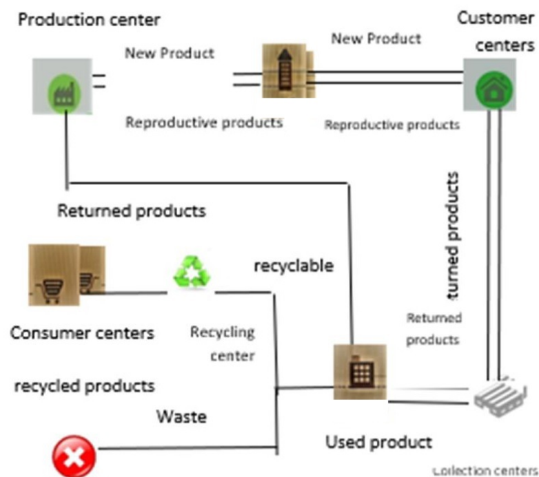
Figure 1: The supply chain network structure

In this research, given the characteristics in the literature models, the model is closely related to the real world. The model structure is a multi-stage single product closed-loop supply chain. Environmental factors and fuzzy data are studied.