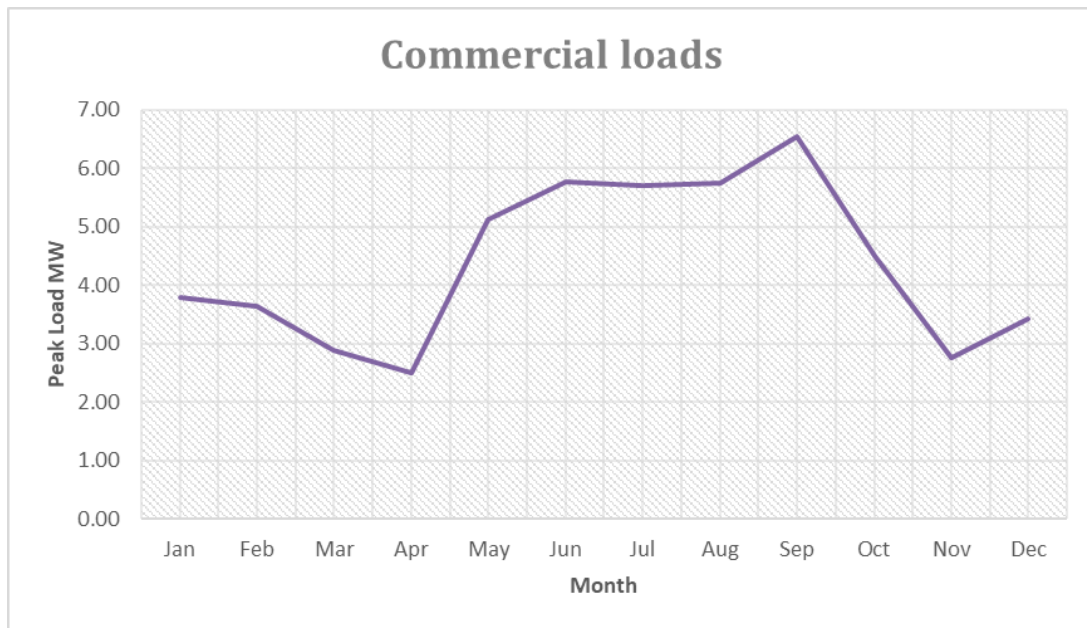
Figure 5: Commercial loads.