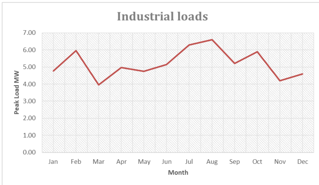
Figure 3: Industrial loads.