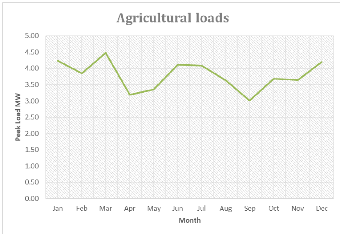
Figure 2: Agricultural loads.

Loads were determined according to consumption patterns at the level of the customer category during the 12-month peaking period, the sub-stations were chosen from the Babylon network sites, which are dominated by the load from one of the residential, commercial, industrial or agricultural parts. Loads were determined according to consumption patterns at the level of the customer category during the 12-month peaking period, the sub-stations were chosen from the Babil network sites, which are dominated by the load from one of the residential, commercial, industrial or agricultural parts. As it was observed in Figure 2, the high and low agricultural loads are related to the seasonal planting seasons that start by the spring season in March. Industrial loads Figure 3, whose Hittite loads increase in the summer months of July and August [19].