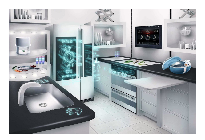
Figure 2: Smart kitchen devices

Figure 2 shows how the various components in the smart kitchen devices interact with each other. We can hope to see a speeding up from one million units (keen devices) in 2014 to more than 470