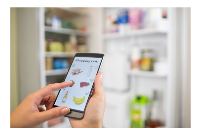
Figure 3: Smart controlling