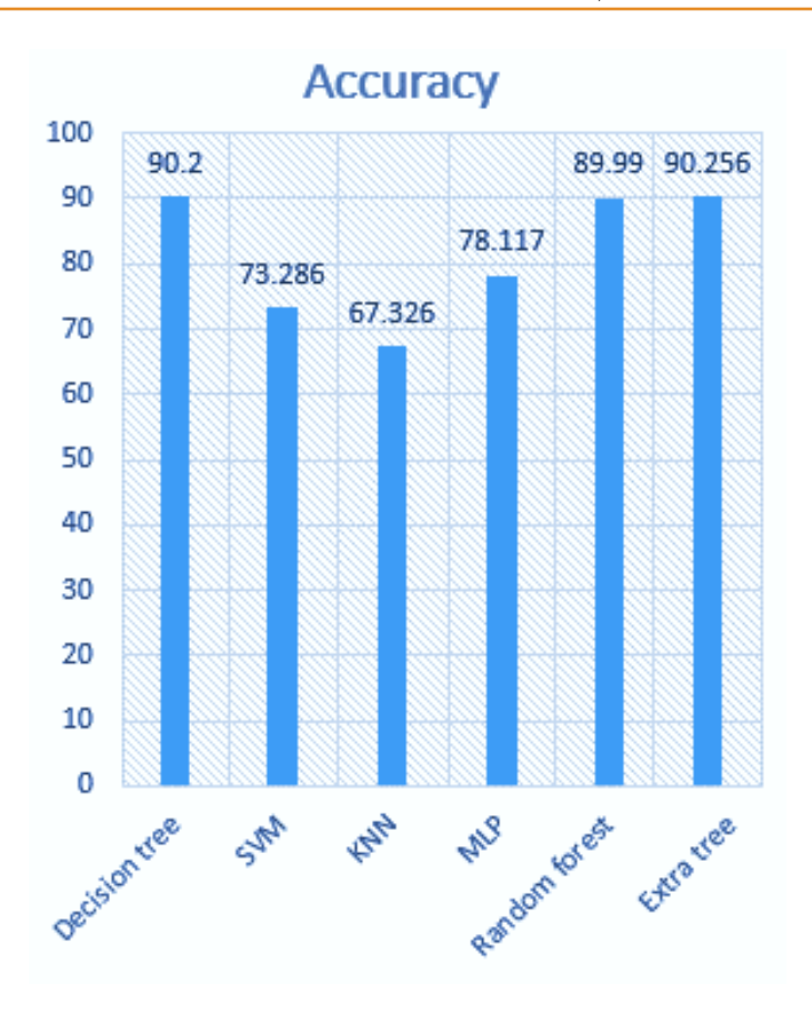
Figure 1: The accuracy results of machine-based learning models for fake news evaluation